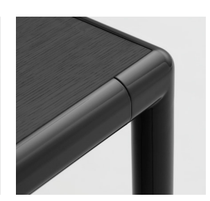
Oak Veneer Black Lacquer (Legs Glossy or Textured)