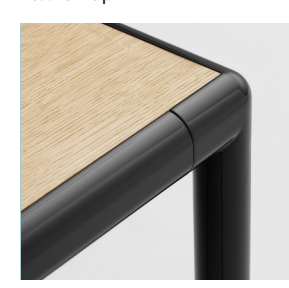
Oak Veneer (Legs Glossy or Textured)