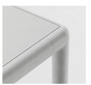
Aluminium (Table top always Textured Paint Legs Glossy or Textured Paint)