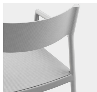
Aluminium (only available for Chair & Stackable armchair)