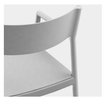
Aluminium (only avaliable for Chair & Stackable armchair)