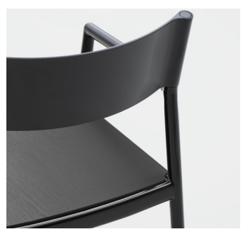
Papiro Tapissée Oak Veneer Oak Veneer Black Lacquer