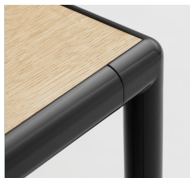
Oak Veneer (Legs Glossy or Textured)