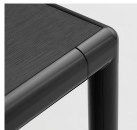
Oak Veneer Black Lacquer (Legs Glossy or Textured)